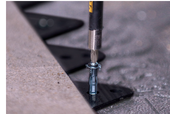
5/8" (15mm) height

For use on: GATOR TILE EDGE are use to support, stabilize and offer a strong lateral support for the perimeter of a porcelain tile installation for a patio, sidewalk, pool surrounding & terrace fasten to the Gator Base with the help of the Gator Base Screws.