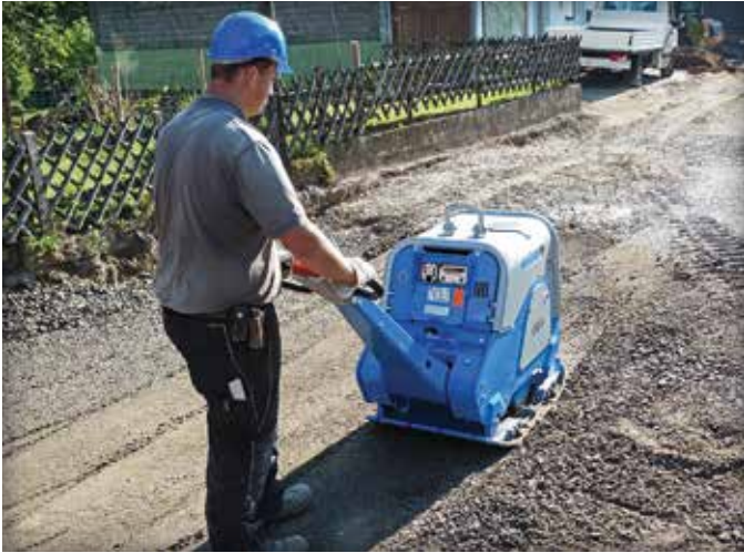
Figure 4. Base compaction with a reversible plate compactor.