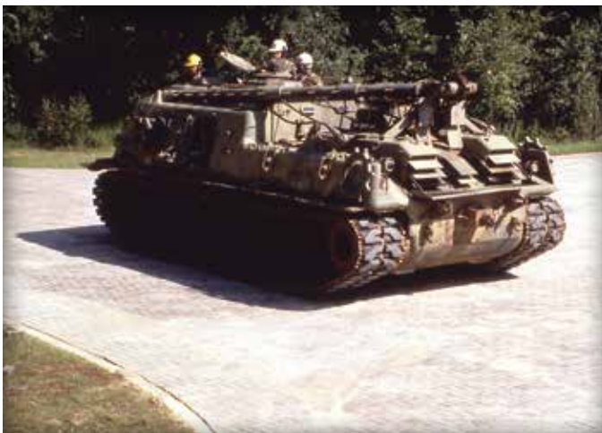
Figure 13. The completed paved area from Figure 12 receives tank traffic at the U.S. Army Proving Grounds in Aberdeen, Maryland.

ICPI Tech Spec 9—A Guide Specification for the Construction of Interlocking Concrete Pavement helps translate construction methods and procedures described here into a construction document. Tech Spec 9 provides a template for developing project-specific materials and installation specifications for