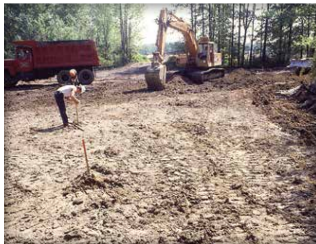
Figure 1. Excavation of the soil subgrade and placing grade stakes.

Prior to excavating, check with the local utility companies to ensure that digging does not damage underground pipes or wires. Many localities have one telephone number to call at least two days before excavation for marking utility line locations. Overhead clearances should be checked so that equip-