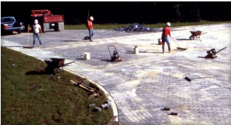
Figure 12. Removing excess sand from the finished surface will make the pavement ready for traffic.

sand is wet, it should be spread on a clean, hard surface to dry before being spread on the pavers and compacted into the joints. Joint sand may be finer than the bedding sand to facilitate filling of the joints like a sand meeting ASTM C144 or CSA A179 requirements. See Table 6. Bedding sand also can be used to fill the joints, but it may require extra effort in spreading and compacting. Compaction should be within 6 ft (2 m) of an unrestrained edge or laying face. All pavers within 6 ft (2 m) of the laying face should have the joints filled and be compacted at the end of each day. Excess sand is then removed. See