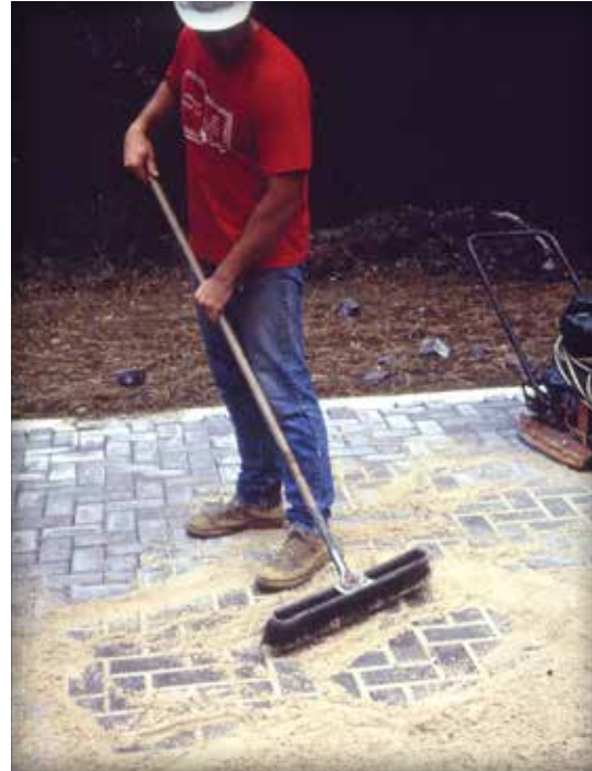
Figure 10. Spreading the joint sand.

Edge restraints must be set at the correct level, especially if the tops of the restraints are used for screeding the bedding sand. Their elevations should be checked prior to placing the sand and pavers. A minimum of 1 in. (25 mm) vertical restraining surface should be in contact with the side of the paver to adequately restrain it. For heavy duty application a greater restraining surface may be warranted. Edge restraints are typically installed before the bedding sand and pavers are laid. However, some restraints can be secured into the base as the laying progresses.