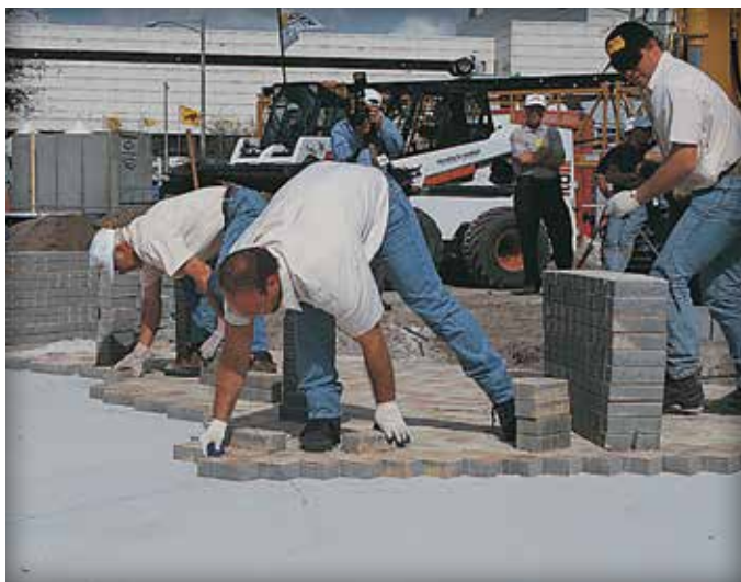
Figure 7. Placing the concrete pavers.

Edge restraints are a key part of interlocking concrete pavements. By providing lateral resistance to loads, they maintain continuity and interlock among the paving units. Aluminum, steel, plastic, or concrete are typical edge restraints. Consult ICPI Tech Spec 3 on edge restraints for recommendations on applications and construction.