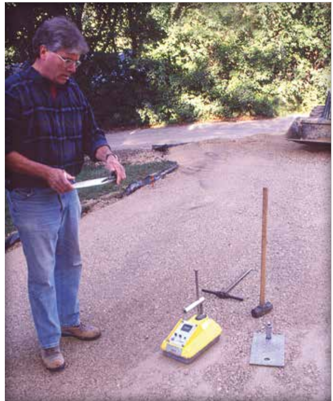
Figure 5. Density testing of the aggregate base with a nuclear density gauge.

Many localities determine base thickness with the 1993 Guide for the Design of Pavement Structures published by the American Association of State Highway and Transportation Officials (AASHTO). The AASHTO procedure calculates the structural number (SN) of the strength coefficients of each base and pavement layer. The SN is determined by assessing the traffic loads, soils, and environmental factors (e.g., drainage, freeze-thaw). The layer coefficient recommended for 3 1 / 8 in. (80 mm) thick pavers on 1 in. (25 mm) bedding sand is 0.44 per inch (25 mm), i.e., the SN = 4^{1/8} \times 0.44 = 1.82 . Base thicknesses can be readily determined by using the charts in ICPI Tech Spec 4—Structural Design of Interlocking Concrete Pavement for Roads and Parking Lots or ICPI Structural Design Software. This software is available for free download on www.icpi.org .