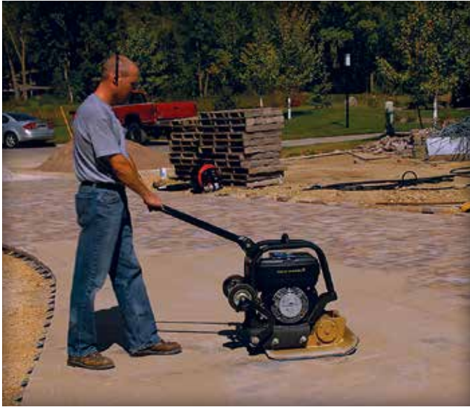
Figure 11. Vibrating sand into the joints.

screeded it should not be disturbed. Sufficient sand is placed and screeded to stay ahead of the placed pavers. Powered screeding machines that roll on rails and asphalt spreading machines adapted for screeding sand have been successfully used on larger installations to increase productivity.