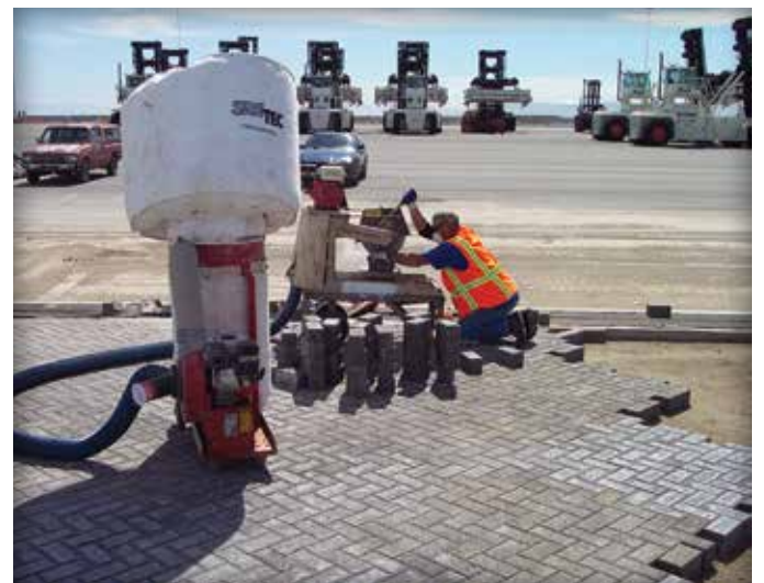
Figure 8. Saw cutting pavers.