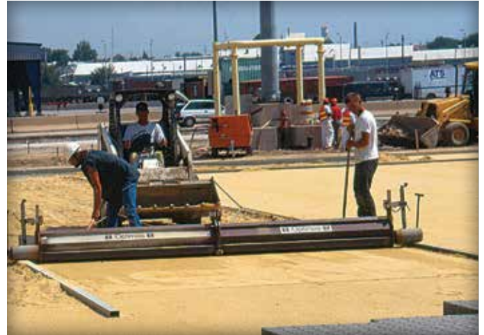
Figure 6a & 6b. Screeding the bedding sand.

Like compaction of the soil subgrade, adequate compaction of the base is critical to minimizing settlement of interlocking concrete pavements. See Figure 4. Special attention should be given to achieving compaction standards adjacent to edge restraints, catch basins and utility structures. When spread and compacted, the aggregate base should be at its optimum moisture. Bases for pedestrian areas and residential driveways should be compacted a minimum 98% of standard Proctor density. For vehicular areas, compaction should be at least 98% of modified Proctor density as determined by ASTM D1557, or AASHTO T180. While the highest percentage compaction (100%) is preferred, it may not be achievable on weak or saturated soils. Density measurements of the compacted base should be made with a nuclear density gauge or other methods approved by the local, state or provincial transportation department. See Figure 5. Unless otherwise specified, the compacted thickness of individual lifts should be +3/4 in. to -1/2 in. (+19 mm to -13 mm). Maintaining consistent lift thickness during compaction will help achieve consistent density. Variation in