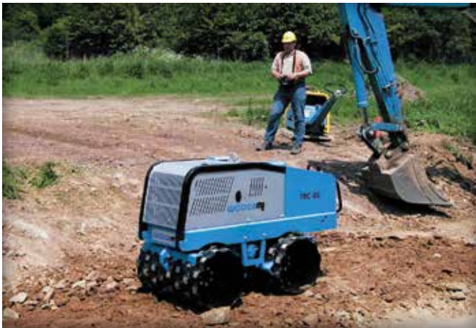
Figure 2. Compacting the soil subgrade.