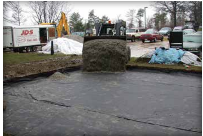
Figure 3. Application of the geotextile under aggregate base.

ment does not interfere with wires. Site access by vehicles and equipment should be established so that the job can be built without delays.