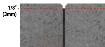
PAVERS OR NATURAL STONES WITH CHAMFER

POLYMERIC SAND REQUIREMENTS Minimum joint width: 1/8" (3 mm) Maximum joint width: 1" (2.5 cm) Minimum joint depth: 1 1/2" (38 mm)