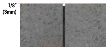
PAVERS OR NATURAL STONES WITHOUT CHAMFER